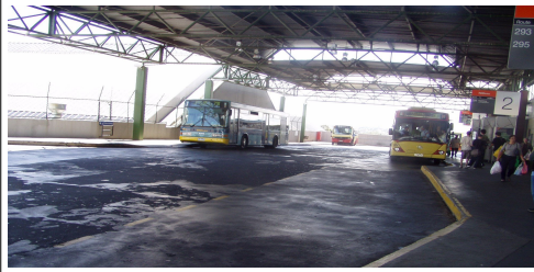
Box Hill interchange is dark, uninviting and poorly integrated.

Greater Dandenong, Knox, Manningham, Maroondah, Monash, Whitehorse and Yarra Ranges Councils