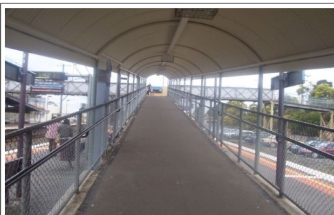
Ringwood Station is not DDA compliant and perceived to be unsafe

While waiting times should be kept to an absolute minimum, the comfort of transport interchanges is critical to ensuring a positive transport experience, competitive with private vehicle travel.